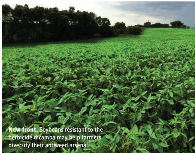
New front. Soybeans resistant to the herbicide dicamba may help farmers diversify their antiweed arsenal.